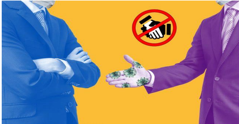
Don't shake hands to stop the spread of Covid-19